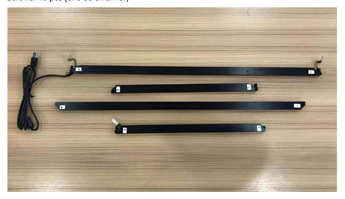
Step: 1 Find the right place A-A, B-B, C-C, D-D.